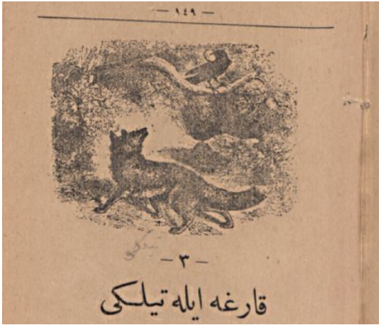
“Crow and Fox” (Source: Ali Seydi, 1916)